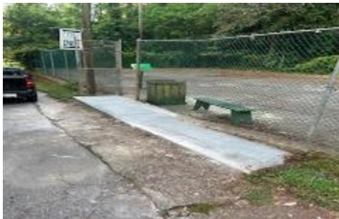
Tennis Court Entrance