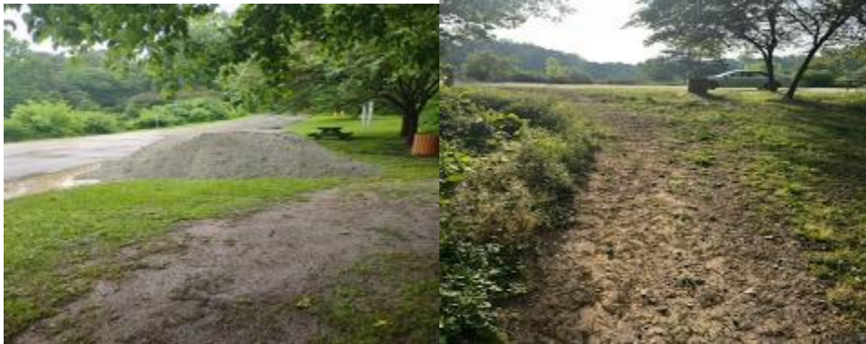
Western Wetlands Entrance